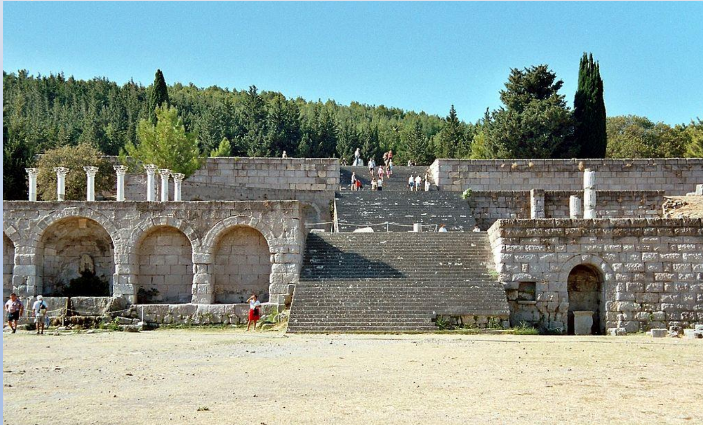
Asklepieion of KOS